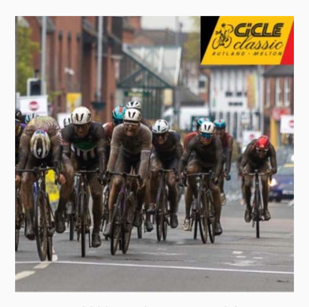
April 2023 – OCGCP benefactor sponsors CiCLE classic

We were pleased to sponsor, and present, one of the team prizes in the Rutland – Melton International CiCLE Classic on Sunday 23rd April. Our sponsorship was paid for by a very generous, but anonymous, benefactor to enable us to promote the Project to a wider audience.