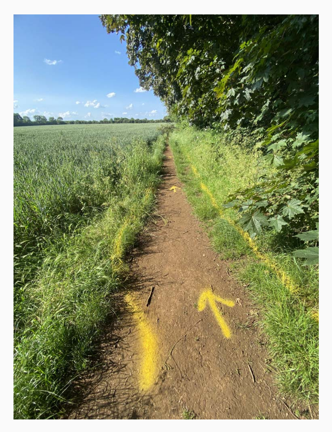
September 2023 - Next major footpath project

Our next major project will be to create a new Permissive Footpath route, along the commonly used field boundary just north of the Oakham bypass.