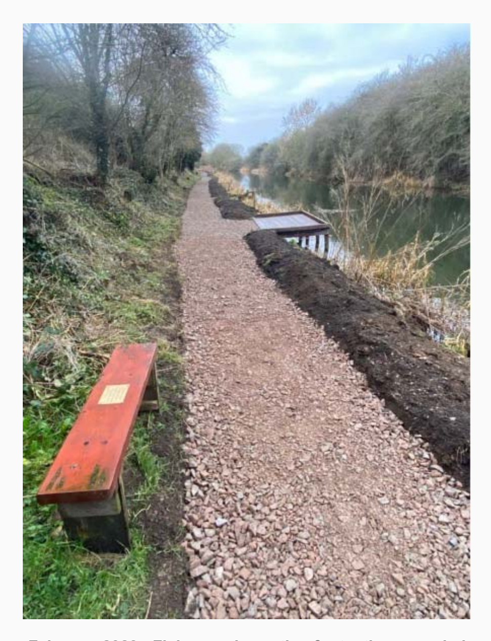
February 2023 - Fishermen's section footpaths upgraded

In late February, braving rather horrible weather, our volunteers replaced both the aggregate path on the east bank of the Fishermen's section and the chipping based path, through the woodlands, on the west bank. The vegetation on the east bank has recovered well and the path is beginning to naturalise.