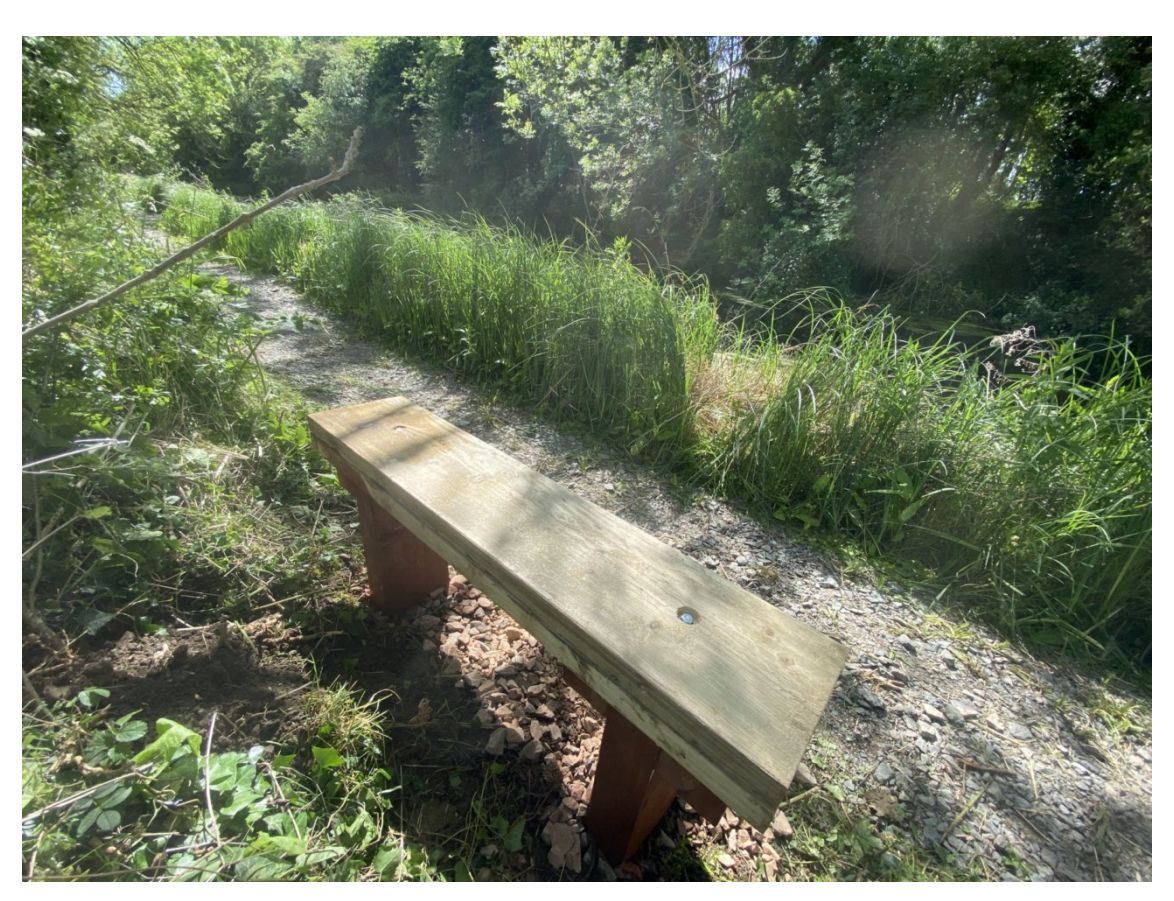
Finally, the sun is shining and summer is here! What better time to catch up with happenings along your canal? We've been busy!