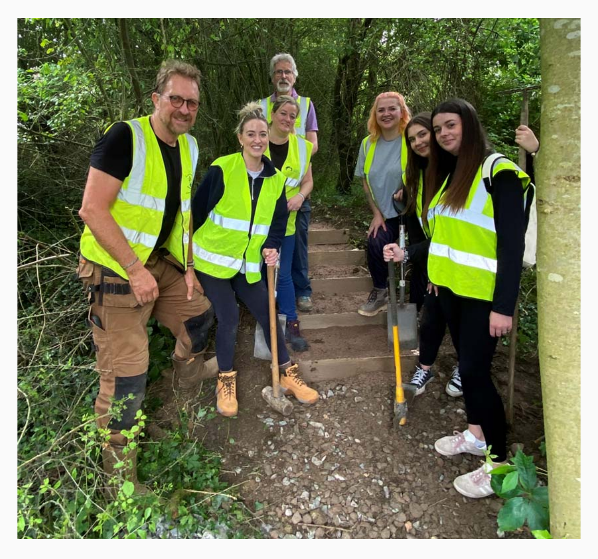
July 2023 Hanson UK Team workparty

We enjoyed a very productive work party with the team from Hansons HQ in Syston.